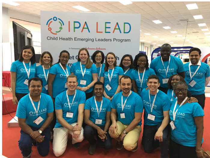
First cohort of IPA LEAD Participants

While pediatricians are recognized experts in child health, they rarely receive formal leadership training as part of their medical education. Effective leadership skills are essential to mobilizing communities, health systems and multi-sector responses to meet the needs of children. IPA LEAD is designed to increase leadership capacity, networking and collaboration among young physicians in pediatric professional societies throughout the world, and to provide high-level mentorship and leadership opportunities for the next generation of global leaders in child health.