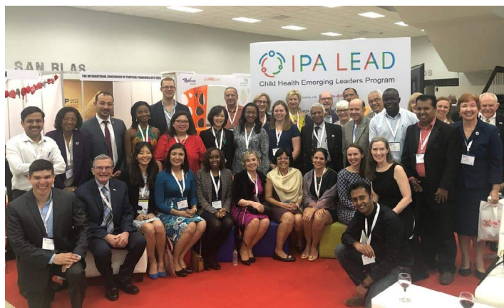
IPA leadership, committee members and LEAD participants at the IPA Congress

For over 100 years, the International Pediatric Association (IPA) has been the only global body representing pediatric professional societies from around the world. IPA provides global leadership on key child health issues; advocates locally, nationally and globally for high quality, evidence-based and child-centered pediatric care; collaborates with leading global health players across multiple sectors to advance maternal and child health; and connects over a million pediatricians, from 143 countries and 164 pediatric member societies, enabling us to work together to improve the health and well-being of more than a billion newborns, children and adolescents worldwide.