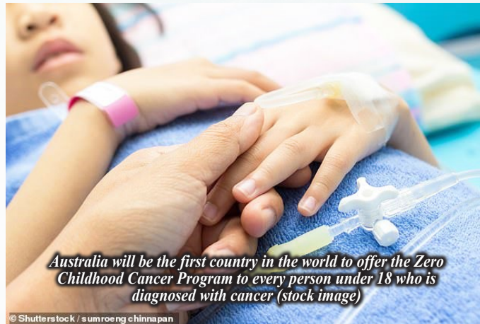
Australia will be the first country in the world to offer the Zero Childhood Cancer Program to every person under 18 who is diagnosed with cancer (stock image)