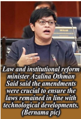
Law and institutional reform minister Azalina Othman Said said the amendments were crucial to ensure the laws remained in line with technological developments.

Law and institutional reform minister Azalina Othman Said says the Bill is crucial to protect children from all forms of sexual exploitation and abuse online