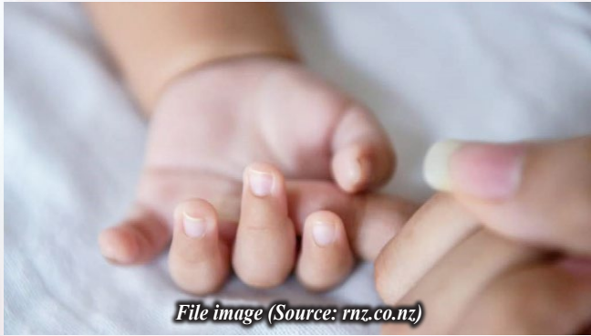
File image (Source: rnz.co.nz)

The two people who died from whooping cough this year were babies under one year old.