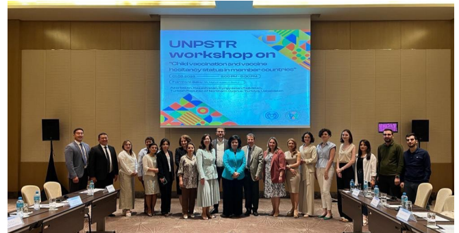
Delegates from UNPSTR member states.

At the end of the workshop, a round table discussion was held on vaccine hesitancy among the population, reasons behind hesitancy and ways to overcome issues with vaccination. Participants decided to create a unified online platform in order to exchange experience and workshop current issues among countries. It was also suggested that follow-up meetings are held 1-2 times each year in order to support close collaboration between the regions.