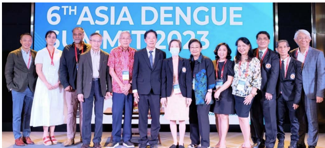
Group photo of the Committee

The 6th ADS was a success. More than 500 speakers and delegates from 25 countries attended the summit. The 2-day event was packed full of inspiring keynote addresses, 5 plenaries, 10 symposiums, 12 oral presentations and 100 e-poster presentations. The topics covered latest advances and understanding of epidemiology, vector control, environmental issues, immunology, new rapid test kits and new vaccines.