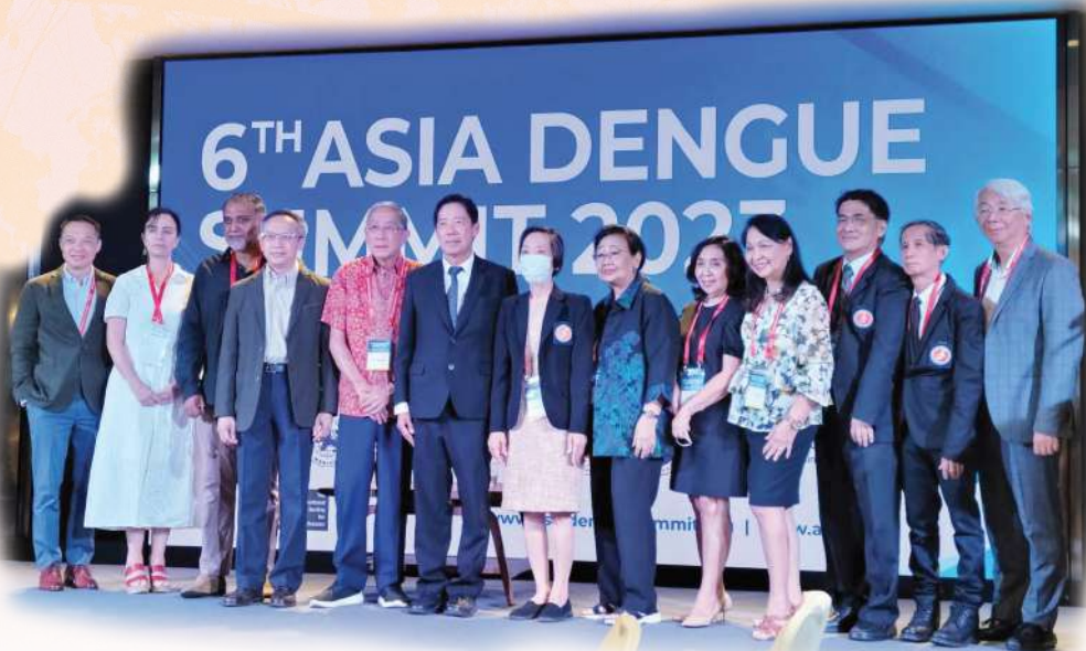
Group photo of the Committee