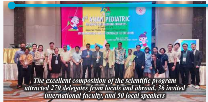
The excellent composition of the scientific program attracted 270 delegates from locals and abroad, 36 invited international faculty, and 50 local speakers

The 4 th Asian Pediatric Intensive Care Congress (APICC) 2023 was held at the Novotel Phokeethra, Phuket, Thailand, on May 8-12, 2023. The congress brought together well-renowned experts worldwide and invited Thai speakers from the Thai Pediatric Respiratory & Critical Care Society (TPRC) and healthcare professionals from various disciplines to discuss the latest advancements and challenges in pediatric critical care.