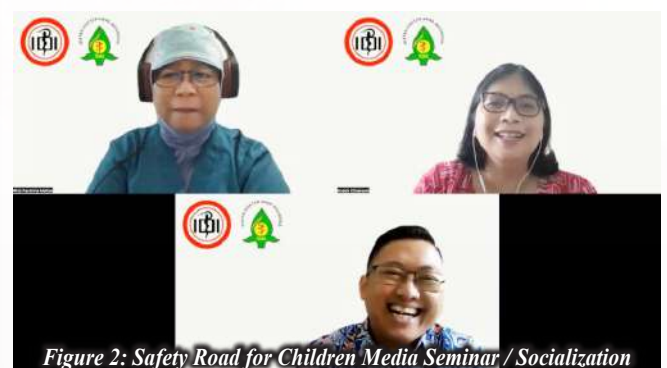
Figure 2: Safety Road for Children Media Seminar / Socialization