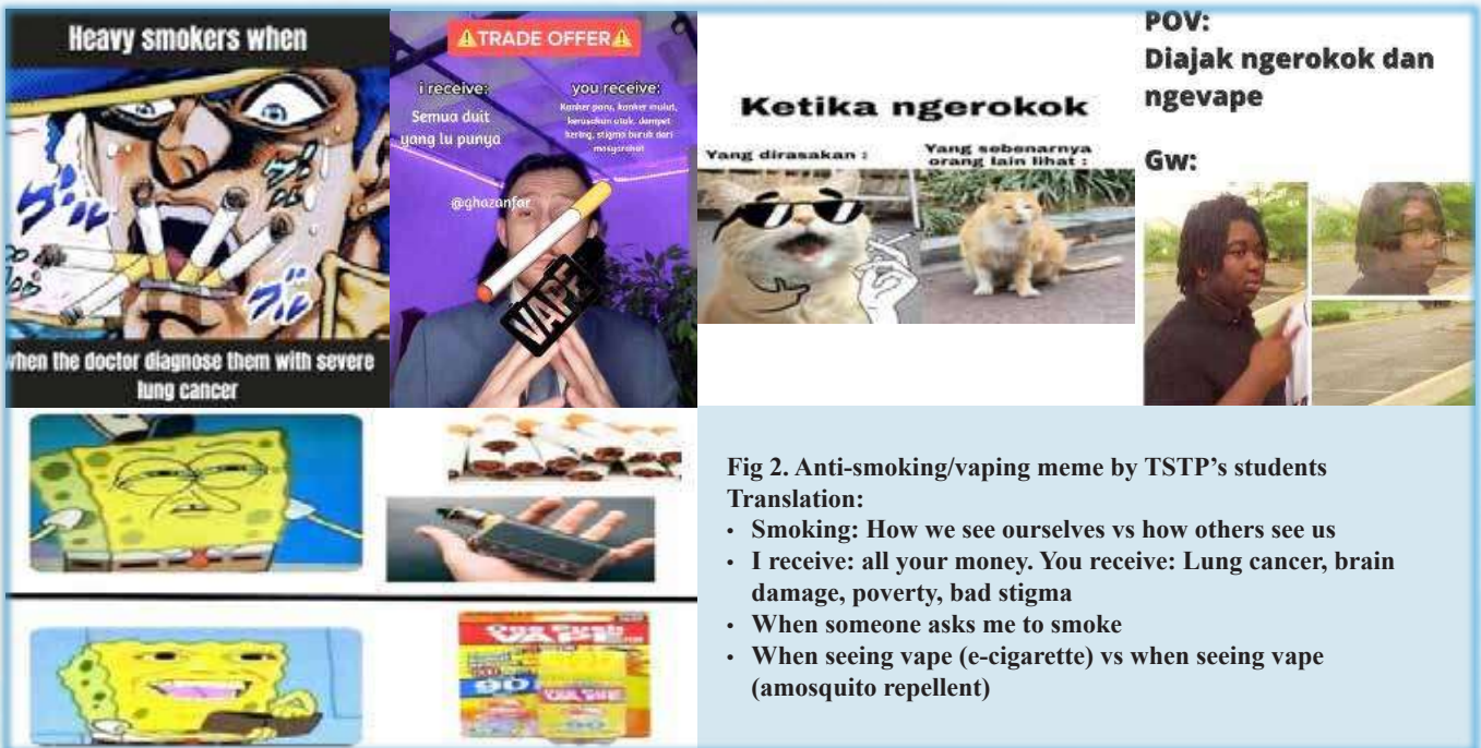
Fig 2. Anti-smoking/vaping meme by TSTP's students