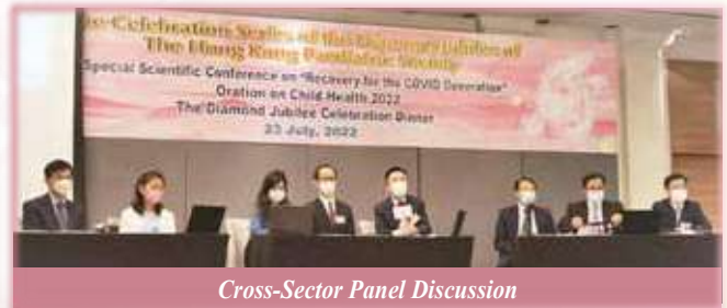
Cross-Sector Panel Discussion