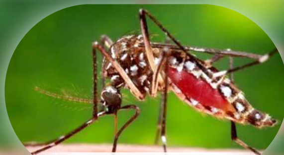
Aedes mosquito

The 6 th Asia Dengue Summit (6 th ADS) is scheduled to take place in Bangkok, Thailand from June 15-16, 2023, with Asia Dengue Voice and Action (ADVA) coordinating the meeting together with the Global Dengue and Aedes Transmitted Diseases Consortium. (GDAC), Southeast Asian Ministers of Education Tropical Medicine and Public Health Network (SEAMEO TROPMED) and The Fondation Mérieux (FMx).