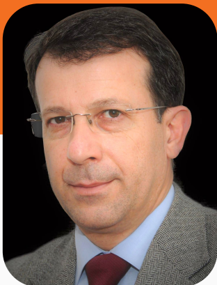
Prof. Koray Boduroglu

Central Asia - Union of National Pediatric Societies of Turkish Republics (UNPSTR)