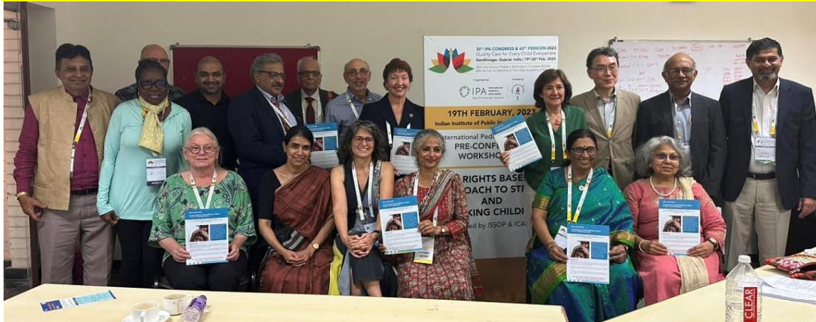
ISSOP members with the Declaration