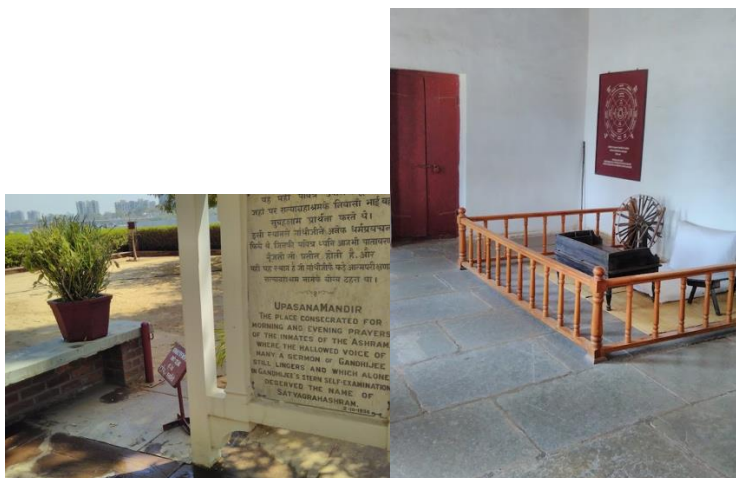
Quote at Gandhi Ashram and spinning wheel used by the Mahatma