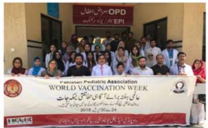
World Immunization Week celebrated by Pakistan Pediatric Association