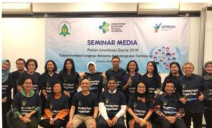
Indonesian Pediatric Society celebrated World Immunization Week by organizing a media conference