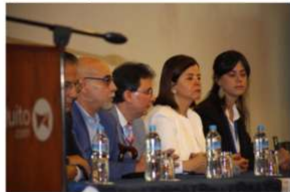
V Annual vaccine forum held by Sociedad Ecuatoriana de Pediatría