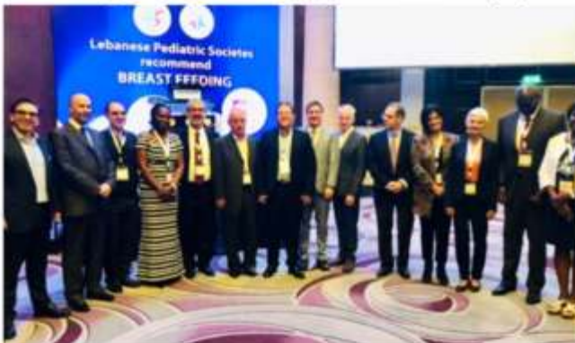
The 15th Annual Congress of the Lebanese Pediatric Societies held on 27-28 April 2018