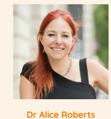
Professor of Public Engagement in Science, University of Birmingham, will facilitate a dynamic discussion with: