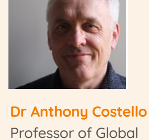
Health and Sustainable Development, University College London