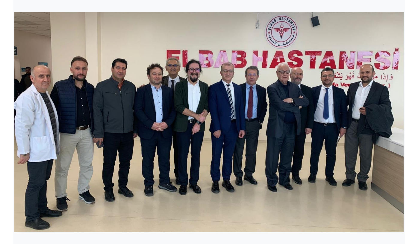
Picture 9: Al-Bab Hospital Medical Director and staff with TNPS members

health in the region. A tour of several departments and pediatric units of the hospital was made again.