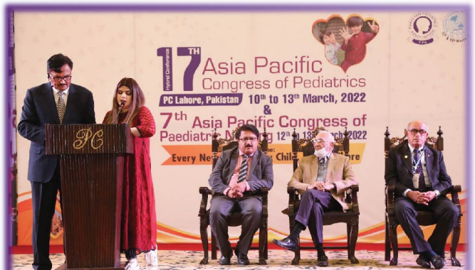
Announcing the names of recipients of the Outstanding Asian Pediatrician Award (OAPA) 2022