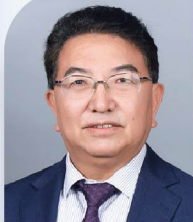
Prof. Wang Tianyou (China)

In conjunction with the 17 th Asia Pacific Congress of Pediatrics (APCP) Hybrid Conference, March 10-13, 2022 & 7 th Asia Pacific Congress of Paediatric Nursing, March 12-13, 2022 at the Pearl Continental Hotel, Lahore, Pakistan