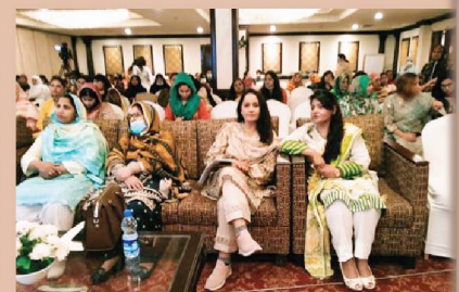
Paediatric Nurses in Pakistan