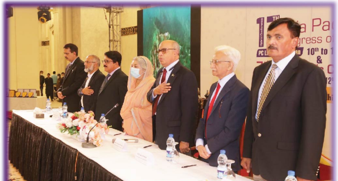
Organising Committee of the 17 th APCP Hybrid Conference during the inaugural ceremony of the event

There was a separate stream of Free papers and posters presentations. Another segment was 2 highly charged sessions on “Controversies in Pediatric and Neonatal Practice”, generating a rich discussion from the floor.