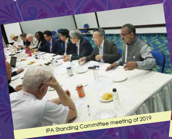
IPA Standing Committee meeting of 2019