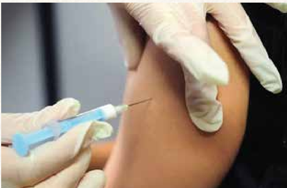
After the death of a boy from diphtheria, the government says parents are responsible for the wellbeing of their children.

On February 23, 2019 a two-year-old boy in southern Johor state, who was not immunised, was believed to have died from diphtheria infection. Five children believed to have been in contact with the boy are in quarantine at the Sultanah Aminah Hospital in southern Johor state capital, Johor Baru, after they tested positive for the disease. - FMT, February 26, 2019