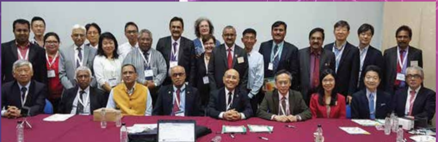
Group photo of APPA delegates and observers after the 38 th APPA Business Meeting in Atlapa Convention Center on March 18, 2019. The meeting was held in conjunction with the IPA 29 th Congress.