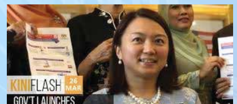
Hannah Yeoh at the launch of the child sex offender registry.

- FreeMalaysiaToday.com, Putrajaya, March 26, 2019