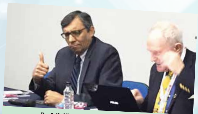
Prof. Zulfiqar Bhutta: A hard act to follow.