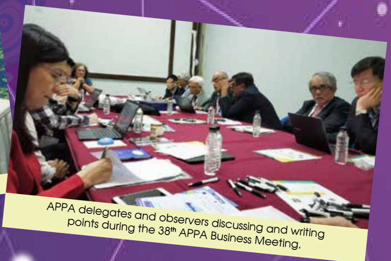
APPA delegates and observers discussing and writing points during the 38 th APPA Business Meeting.