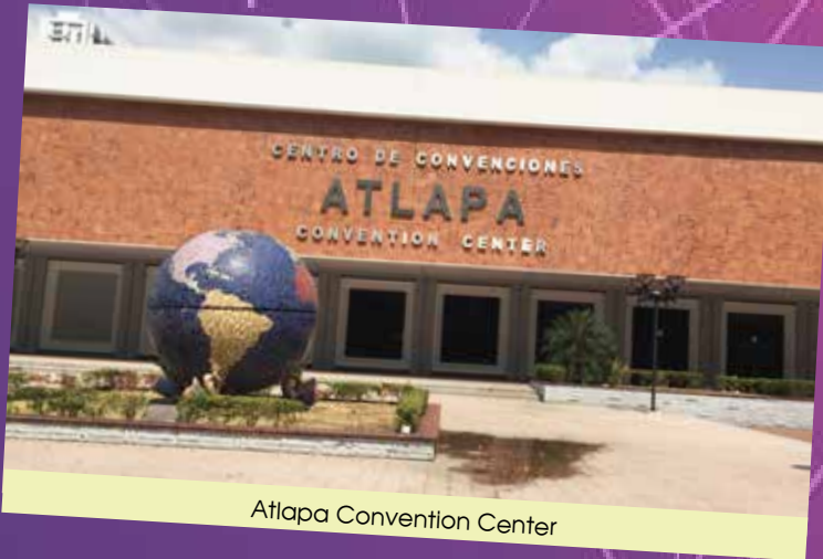
Atlapa Convention Center