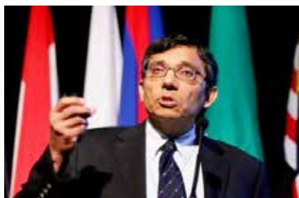
At the 14 th APCP 2012 in Sarawak, Malaysia.