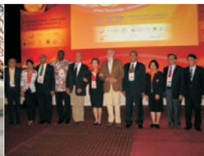
The committee of ISTP at the closing ceremony of the 9th ICTP