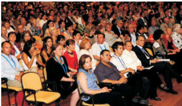
The main Congress hall during the Opening Ceremony