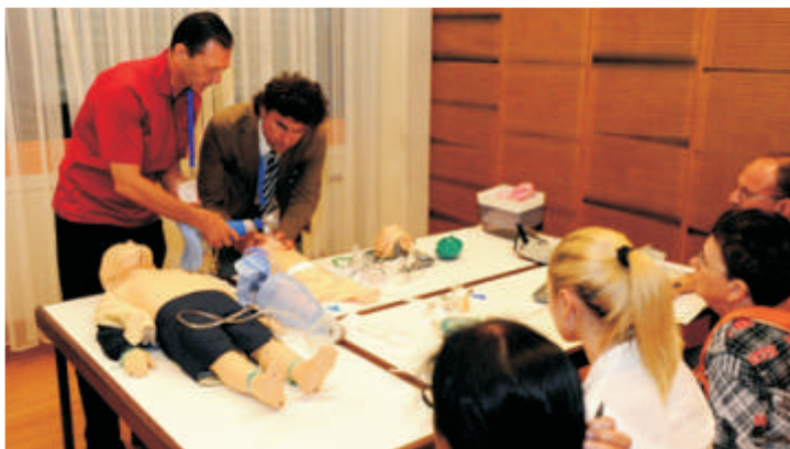
Hands-on during a practical course on paediatric resuscitation