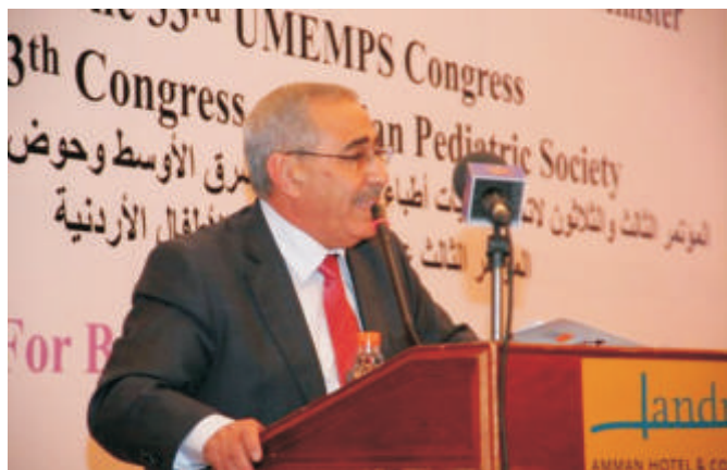
His excellency the Jordanian Minister of Health at the opening ceremony

The UMEMP Sconsists of pediatric societies from 32 countries in the region.