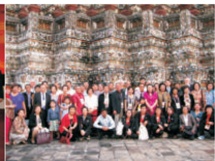
The speakers and committee of the 9th ICTP visit Temple of the Dawn prior proceeding to the Faculty Dinner at the Royal Thai Navy Cruise