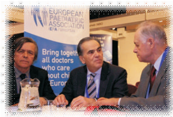
Pictures from the second Excellence in Paediatrics conference in London, UK, 2-4 December 2010

Following the past congresses held in Rome (2000), Prague (2003), Istanbul (2008) and Moscow (2009) the 5th Europaediatrics congress was held in Vienna, Austria, 23-26 June 2011 ( www.europaediatrics2011.org )