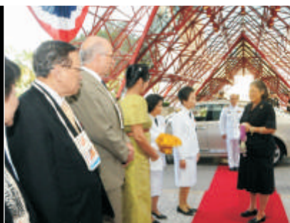
Her Royal Highness Princess Maha Chakri Sirindhorn graciously arrives at the opening ceremony of the 9th ICTP