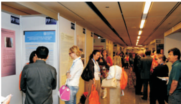
Lively poster session