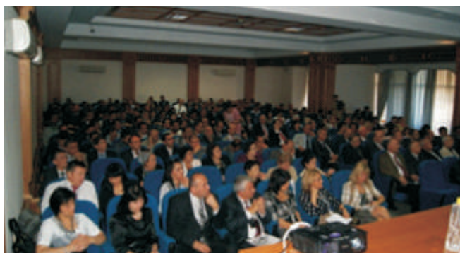
Eleventh Eurasian Congress of Pediatrics