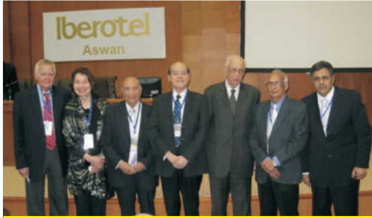
Group Photo at the opening ceremony