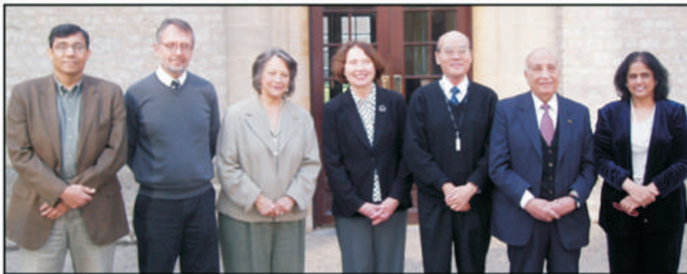
Members of The IPA Executive Committee at the March 2010 meeting at Oxford, England

All best wishes for a happy Holiday Season and a bright and fulfilling New Year From The International Pediatric Association