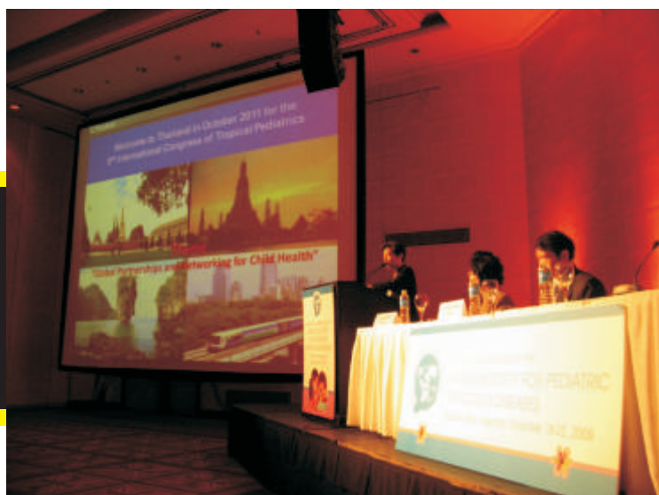
Scientific session at the 6th WSPID