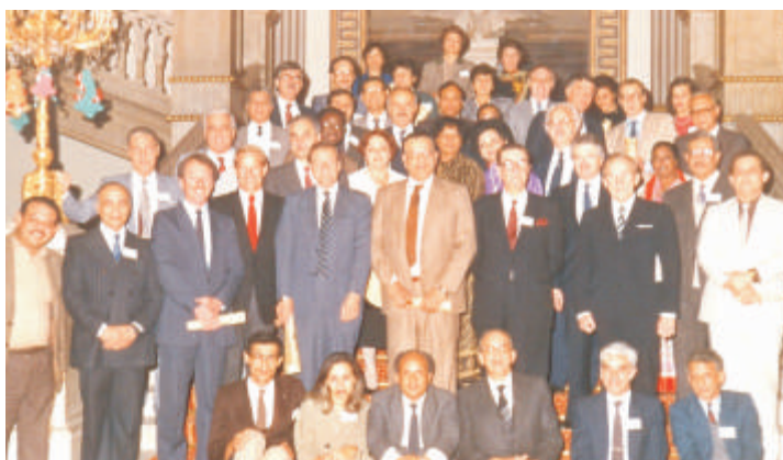
Mediterranean Congress, Cairo - 1984