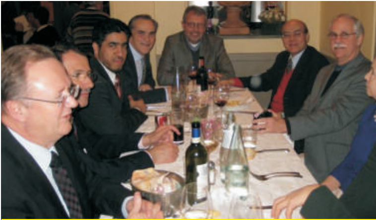
Social dinner hosted by President EPA