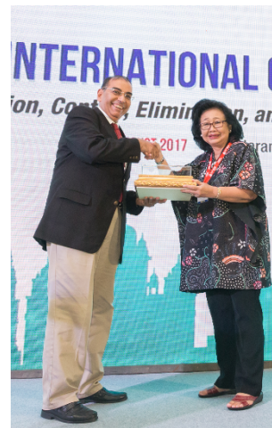
Figure 7. Handover to the 12 th ICTP Organizing Committee

Overall, the congress had been a fruitful scientific congress and experience to understand Indonesian culture for all of the participants. Accordingly, more collaboration and participation that International Society of Tropical Pediatrics (ISTP) could possible give in IPA program or other professional organizations in the future are looked for as we are aware that there are many recent worldwide problem associated with infectious and tropical diseases.