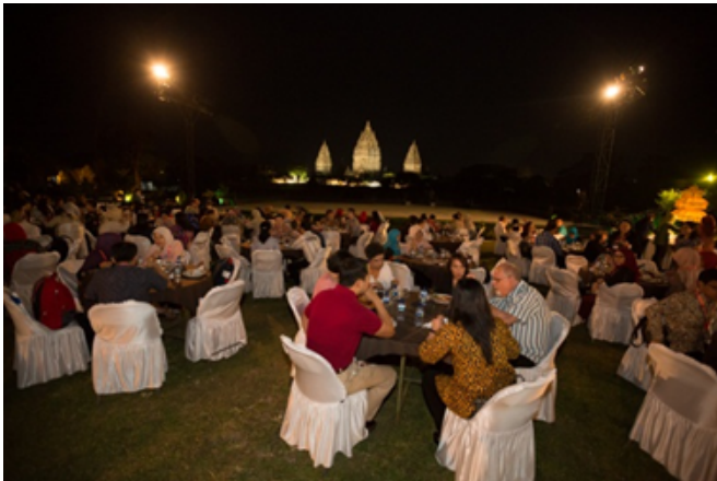
Figure 3. Gala dinner

In light of fruitful scientific events, ICTP also gave local experiences through social program with welcome cocktail that accompanied by traditional Javanese music. First day of the congress was ended beautifully with Gala dinner by the magnificent night view of Candi Prambanan (Hindu’s temple) followed by Ramayana ballet performance. The second night of the congress was dedicated for faculty gathering, an event that was designed for discussion over dinner among the faculty members of the