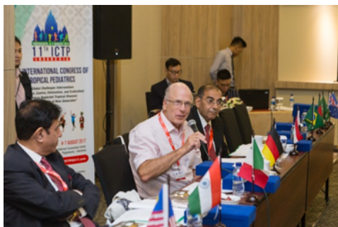
Figure 5. ISTP Business Meeting

To maintain and improve the continuity of ISTP programs, ISTP business meeting was conducted on the second day of the congress presided by the president of ISTP himself. Beginning with the approval of minutes of General Assembly 2014, the discussion rolled to important issues about governance of the organization and plans to maximize ISTP’s role as platform for tropical pediatrics and infectious diseases experts. The meeting was completed with the bidding of the next ICTP which decided Egypt as the following organizing committee.