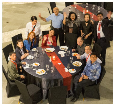
Figure 4. Faculty Gathering

To maintain and improve the continuity of ISTP programs, ISTP business meeting was conducted on the second day of the congress presided by the president of ISTP himself. Beginning with the approval of minutes of General Assembly 2014, the discussion rolled to important issues about governance of the organization and plans to maximize ISTP’s role as platform for tropical pediatrics and infectious diseases experts. The meeting was completed with the bidding of the next ICTP which decided Egypt as the following organizing committee.