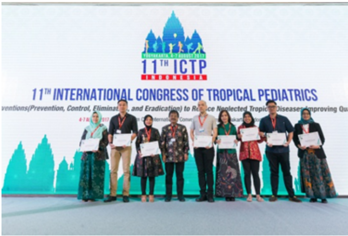
Figure 6. Young paper award in 11 th ICTP

At the end, 3 young paper award winners and the best 5 scientific posters were announced in the Closing Ceremony. The congress ended by the handover ceremony to the next congress organizing committee, the 12 th International Congress of Tropical Pediatrics, that will be held in Egypt.