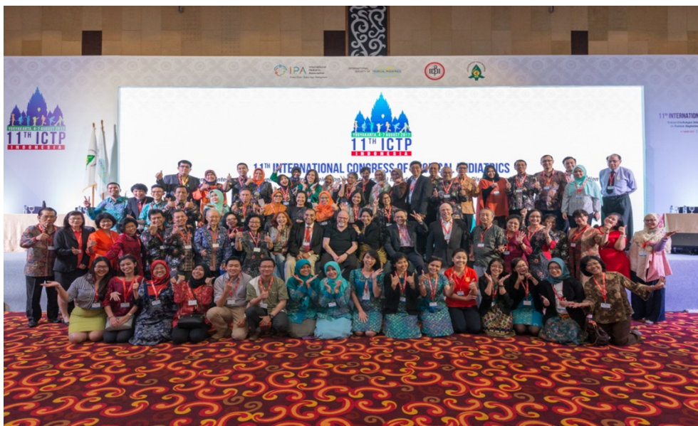
Figure 8. Speakers and committee of 11 th ICTP

“Working for every child, every age, and everywhere”