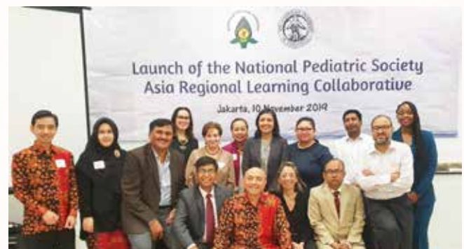
Participants of the Launch of the National Pediatric Society Asia Regional Learning Collaborative together with the American Association of Pediatric.