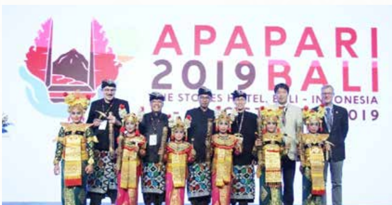
Balinese kids' dancers posing with top representatives from APAPARI, IPS, World Allergy Organization and Pediatric Allergy Immunology Journal.