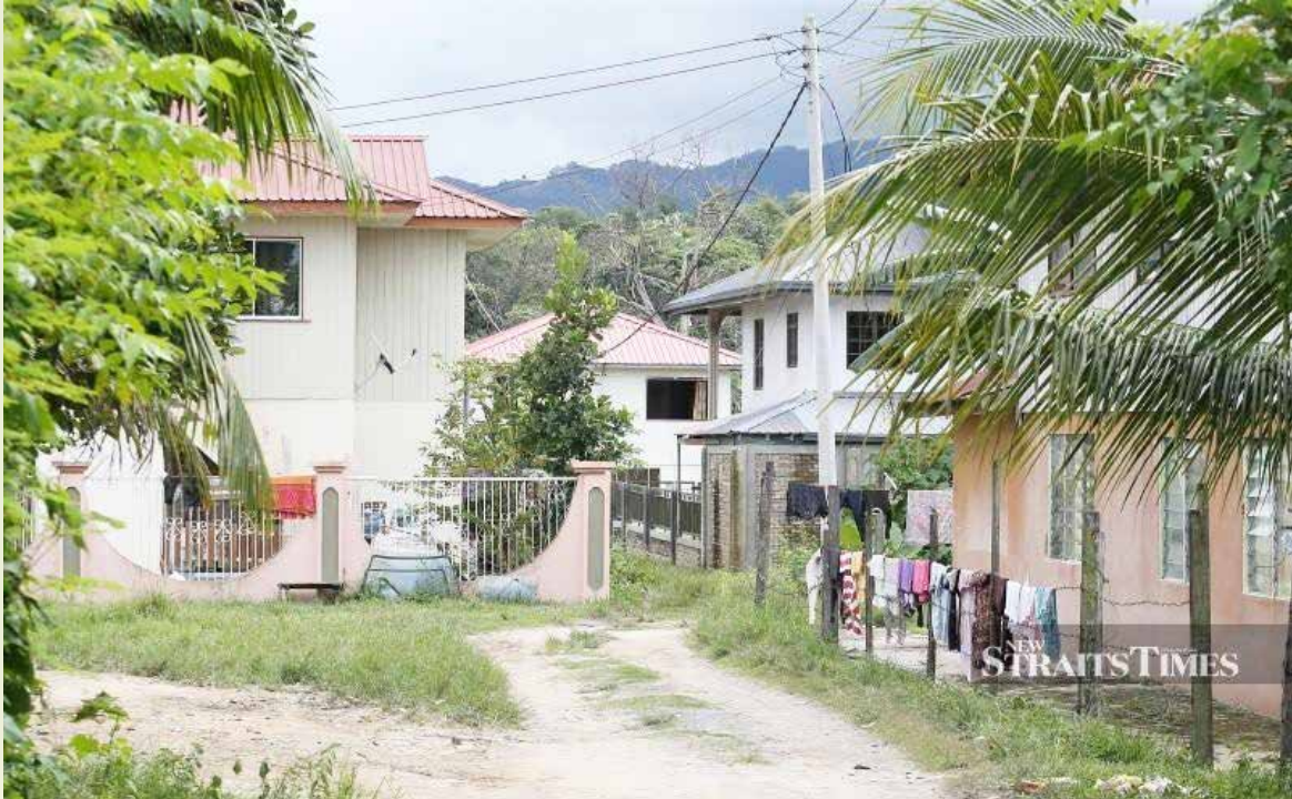
A view of the housing area in Tuaran in East Malaysian state of Sabah, where the three-year-old child who contracted the polio virus, was staying.

The World Health Organization (WHO) and the United Nations Children's Fund (Unicef) have confirmed that the type of polio virus contracted by a 3-month-old Malaysian baby boy in the East Malaysian state of Sabah, is the same virus that is spreading in southern Philippines.