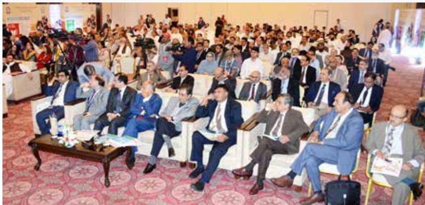
Participants who attended the 19 th National Conference of PPA.