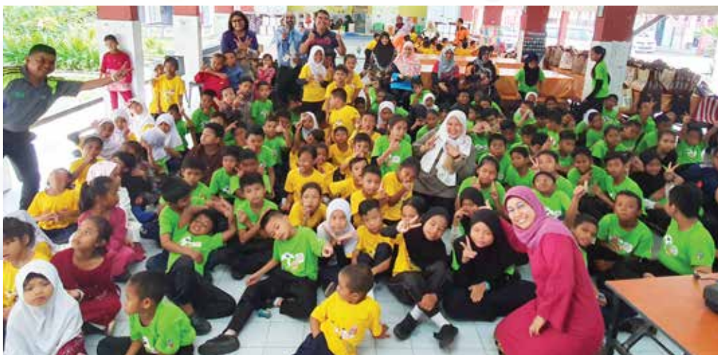
The indigenous primary school children posing happily during the celebration.