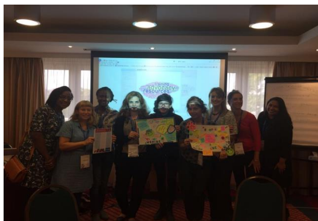
The ISSOP trainees “dream team”